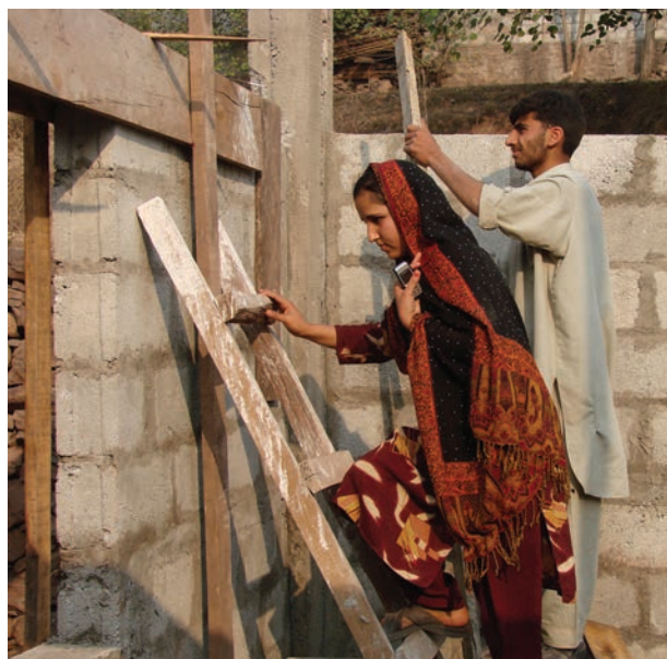
Young Pakistanis work on rebuilding their home in an ERRA-supported reconstruction programme.

The challenges thrown up by the mountainous environment and the post-disaster context, even some years on, were considerable. Some